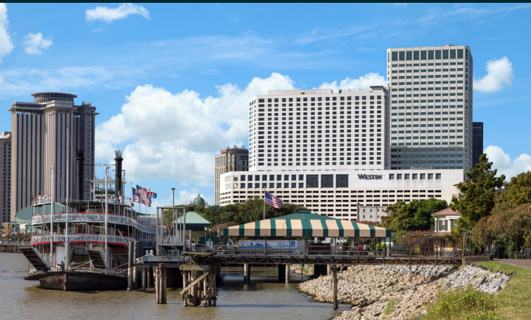
THE WESTIN NEW ORLEANS